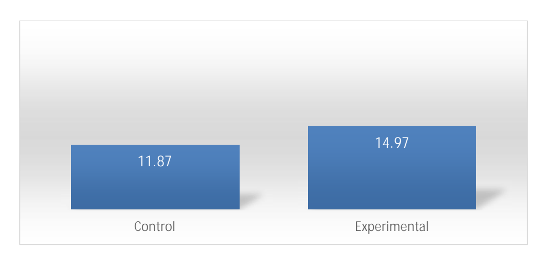
Figure 7. Mean on Post-Test of Reading Achievement by Groups